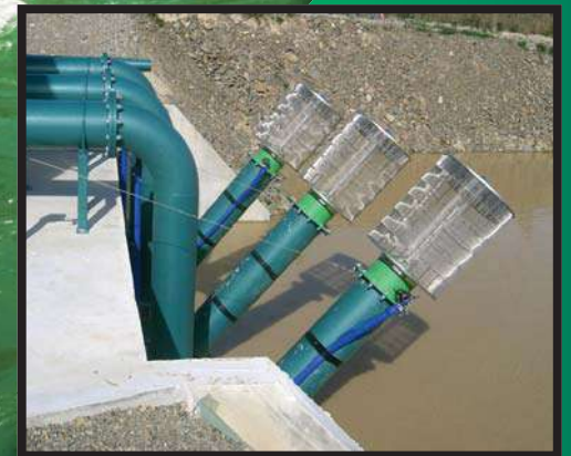
Rotating Screen Reduces Clogging

LAKOS Separators and Filtration Solutions